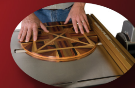
PARQUETRY & MARQUETRY