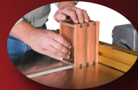
DOVETAILS & OTHER JOINERY