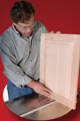
RAISED PANELS & OTHER TALL PARTS