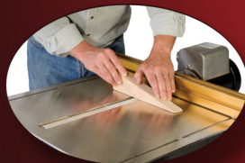
TAPERS, SEGMENTED FINISHING