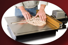
SCROLL SAW & FRETWORK